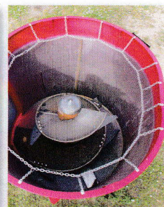
Retention chain option.