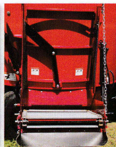
Rotatable tub set for right hand discharge w/optional conveyor.