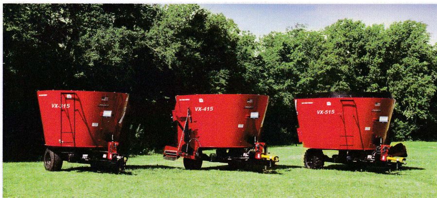
VX Series models: 315, 415 and 515

Most skid-steer loaders can easily load rations into the new Roto-Mix VX series mixers because of their Low-Profile design.