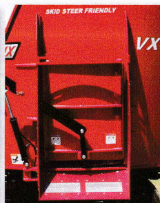
Rotatable tub set for left hand discharge with magnet.